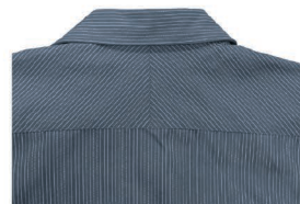
Split yoke to provide better fit

Weights and measurements are approximate and for guidance only.